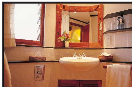
Wash in luxury