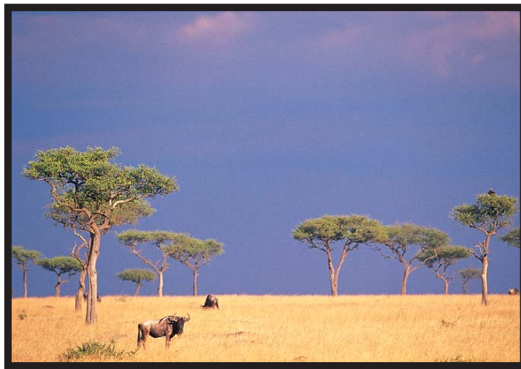
Land of contrasts

Perched on the saddle of a hill, the Mara Serena Safari Lodge has one of the most spectacular views imaginable across the vast plains, forests and rivers that make up the Masai Mara – one of the world's richest wildlife sanctuaries. It is on this very terrain that the annual migration takes place when millions of zebra, wildebeest and gazelle cross the plains below, on their way to the rich new grasses of the Serengeti. This is a spectacle that should be witnessed at least once in a lifetime.