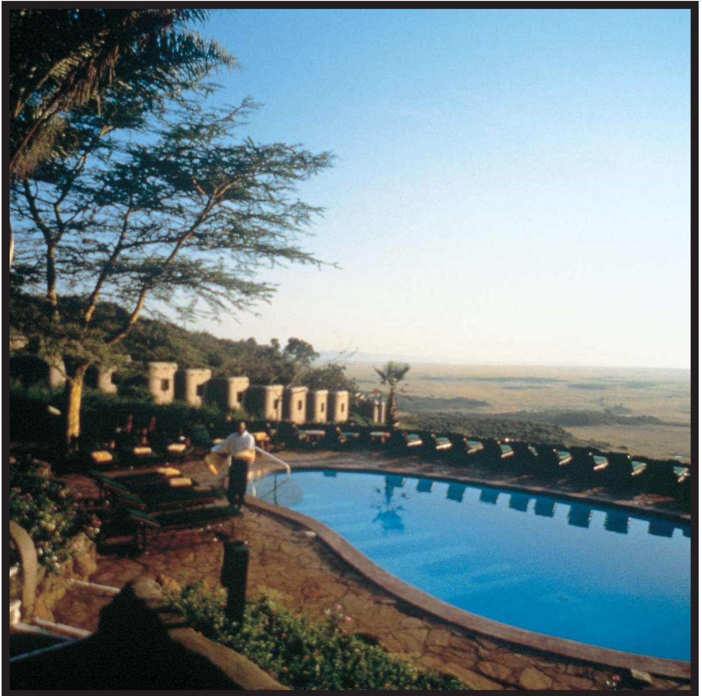
A stunning vista

The lodge has a sky-blue swimming pool perched on the edge of the hill, a restaurant that overlooks a waterhole where wildlife gather and several treatment rooms where you can enjoy a range of relaxing massages.